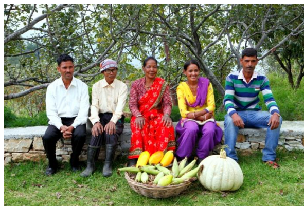
Farmers with their agricultural produce