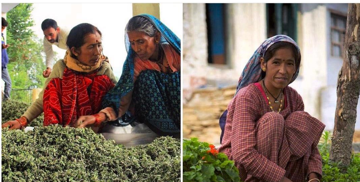
Fig. 2. Farmers doing value addition work to their agricultural produce