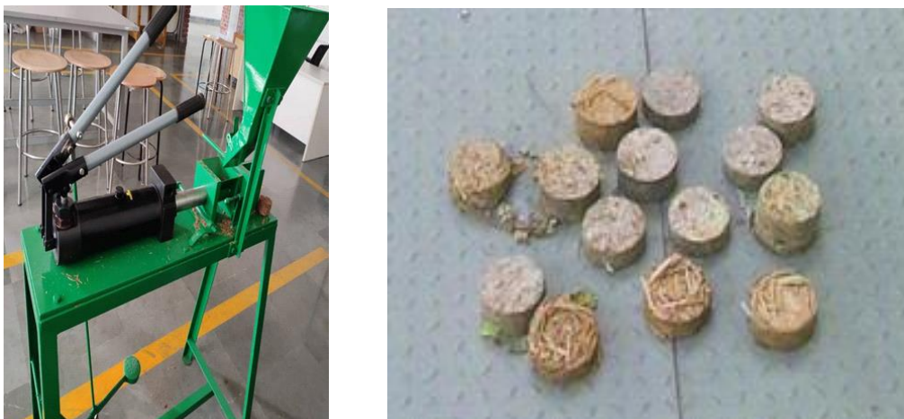
Fig. 4. Manually operated briquetting machine and pine needle briquettes