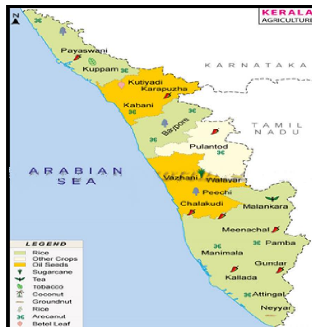
Fig 1: Agriculture map of Kerala

receives sufficient annual rainfall of 3000mm. Kerala state probably facilitates agriculture to a great extent. Due to climate change, there is a change in seasonality and the amount of water flow from river systems. Climate-related issues over Kerala are a decline in forest area, forest fires, declining in wetlands, indiscriminate sand mining, indiscriminate landfilling, groundwater depletion, floods and droughts, landslides, rainfall decline, temperature rise.