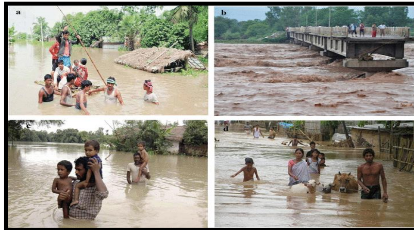
Figure: 1 Photographs showing the severity of the flood that occurred in 2008.